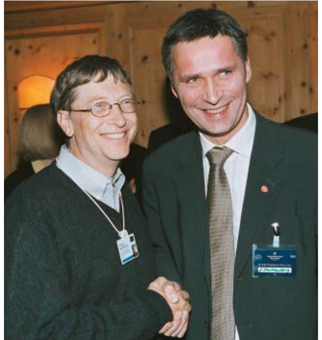
Bill Gates and Vaccine Fund Board member Jens Stoltenberg meet at the World Economic Forum to encourage support for The Vaccine Fund.