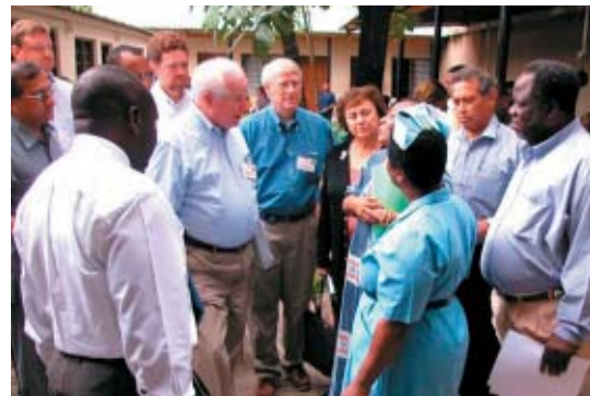
U.S. congressional delegation led by Congressman Jim Kolbe (left, inner circle) meets with healthcare professionals in Tanzania.

The U.S. government was one of the first donor countries to provide financial assistance to The Vaccine Fund and GAVI. •