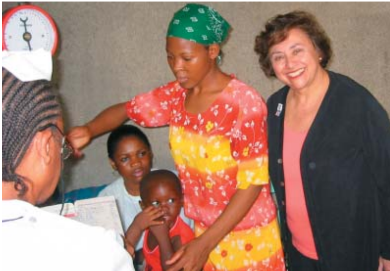
Congresswoman Nita Lowey at a clinic in Dar es Salaam.

In February, several members of the U.S. Congress traveled to South Africa, Botswana and Tanzania to experience first hand the impact of development programs related to U.S. foreign assistance.