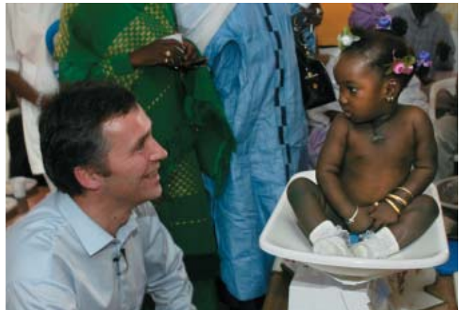
Jens Stoltenberg looks on while a child is being weighed at a clinic in Dakar.

Senegal is also benefiting from other forms of support through GAVI and The Vaccine Fund. By the end of 2003, Senegal had received approximately $247,000 to improve immunization services and over $582,000 for immunization safety supplies.